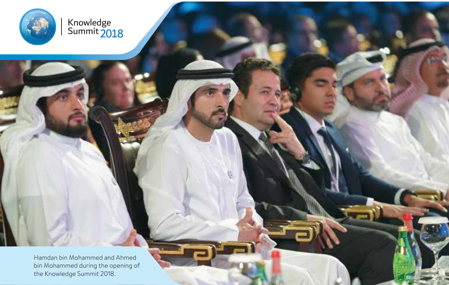
Hamdan bin Mohammed and Ahmed bin Mohammed during the opening of the Knowledge Summit 2018.

The SDGs were approved by all 193 UN member states. The 17 goals are divided into four main themes – environmental, social, economic, and partnerships – and include 169 targets and 233 indicators.