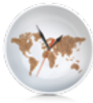
Poverty and Hunger